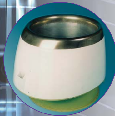
Inlets F10, F20