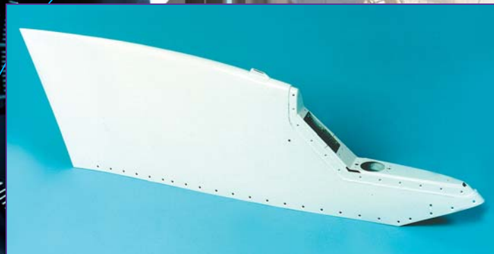
Wing Tips F50, F900